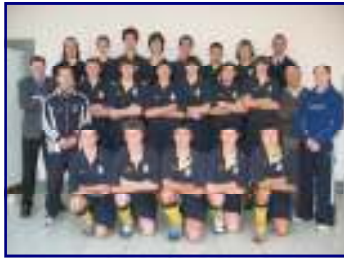
Our history-making Senior Boys team