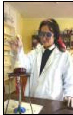
Young Science Project

Sutton Park School prepares students for entrance to major universities around the world.