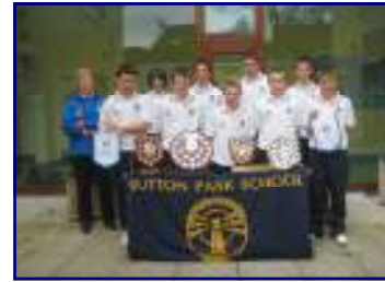
Our record-breaking Badminton teams